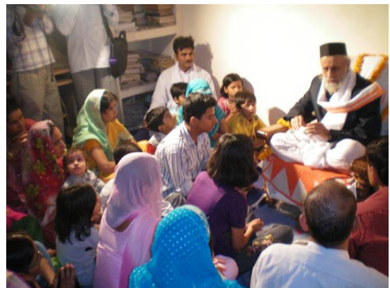
New Delhi Maha Yoga Center